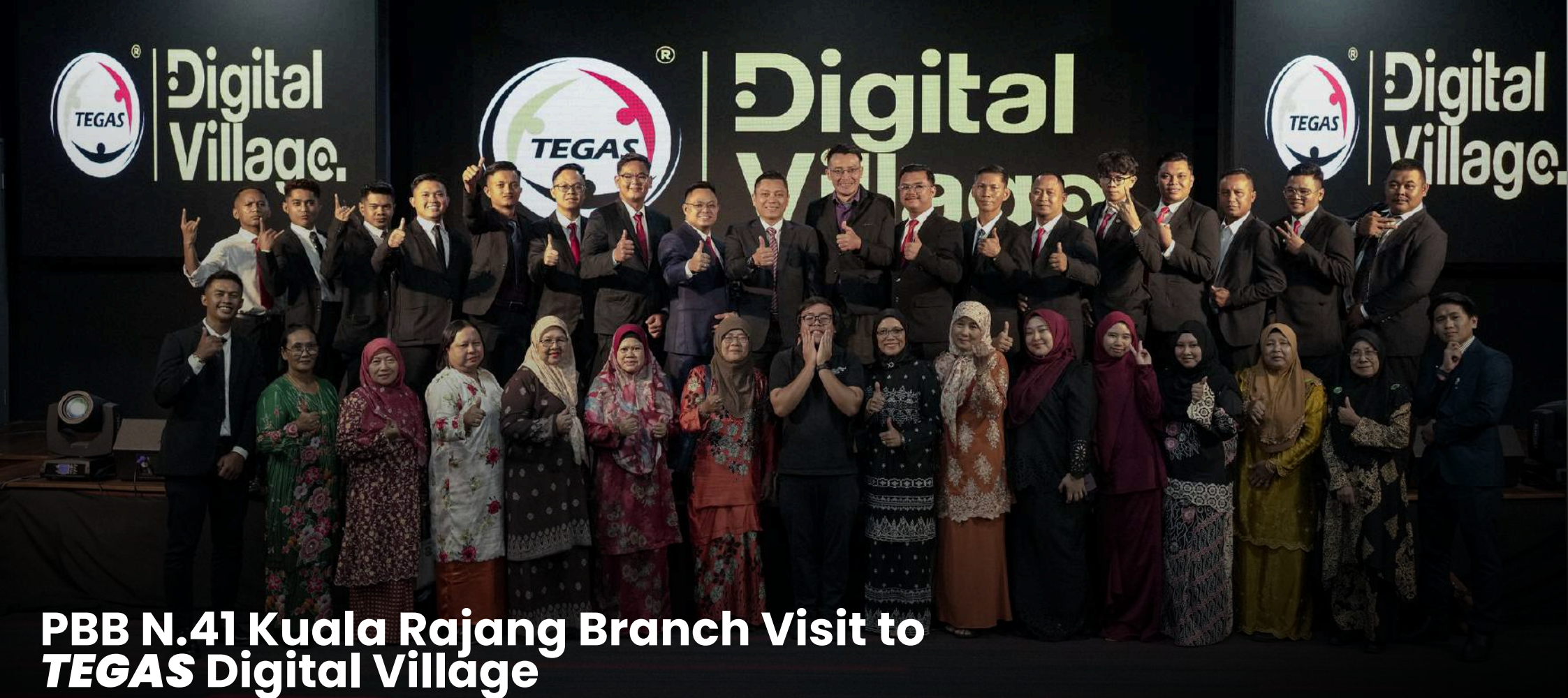
PBB N.41 Kuala Rajang Branch Visit to TEGAS Digital Village