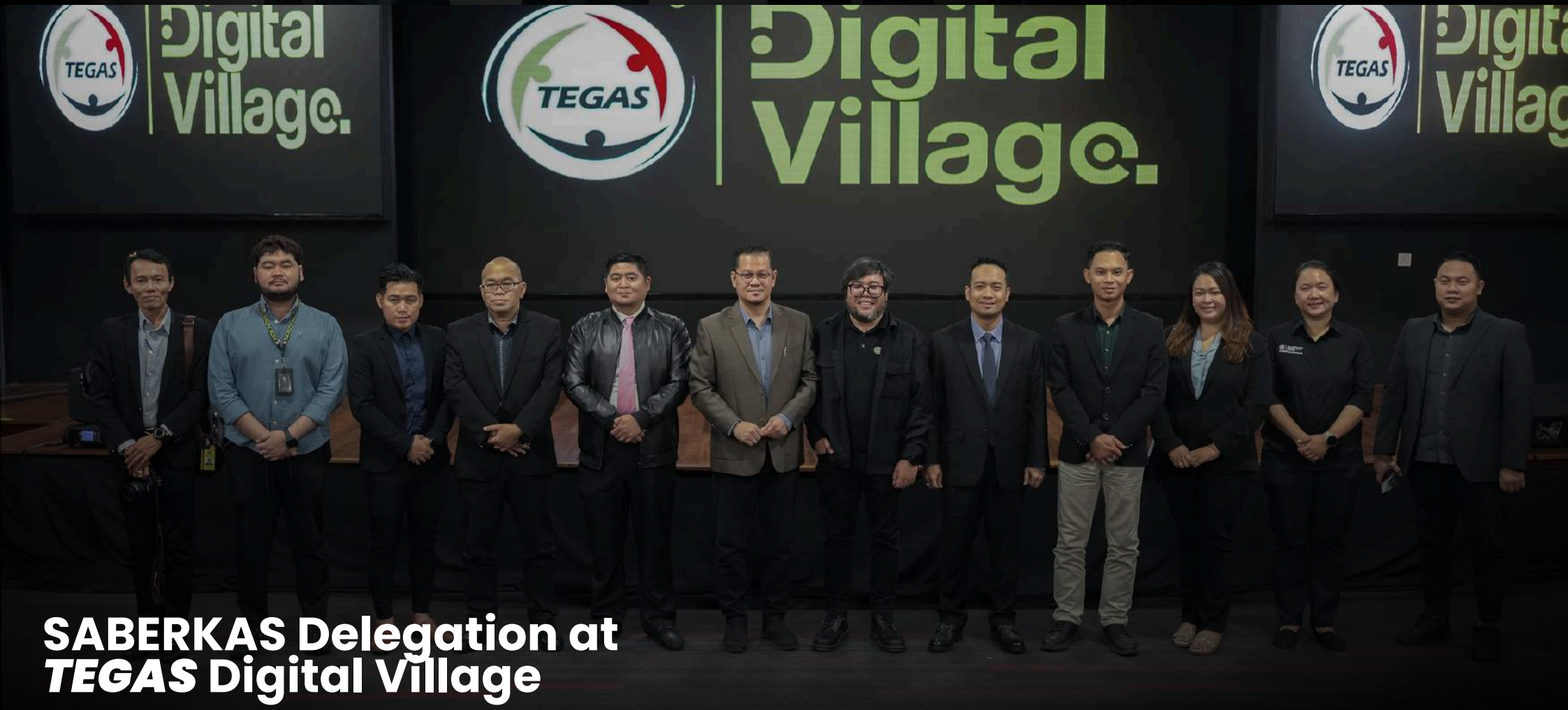
SABERKAS Delegation at TEGAS Digital Village