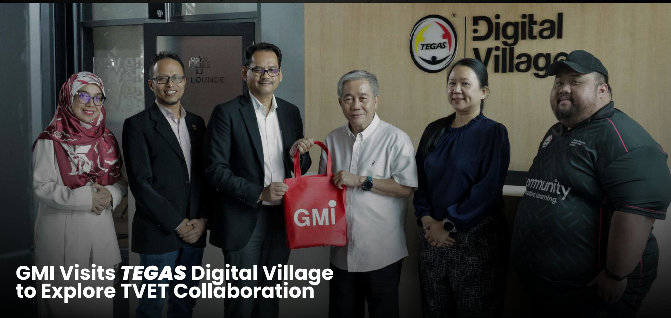
GMI Visits TEGAS Digital Village to Explore TVET Collaboration