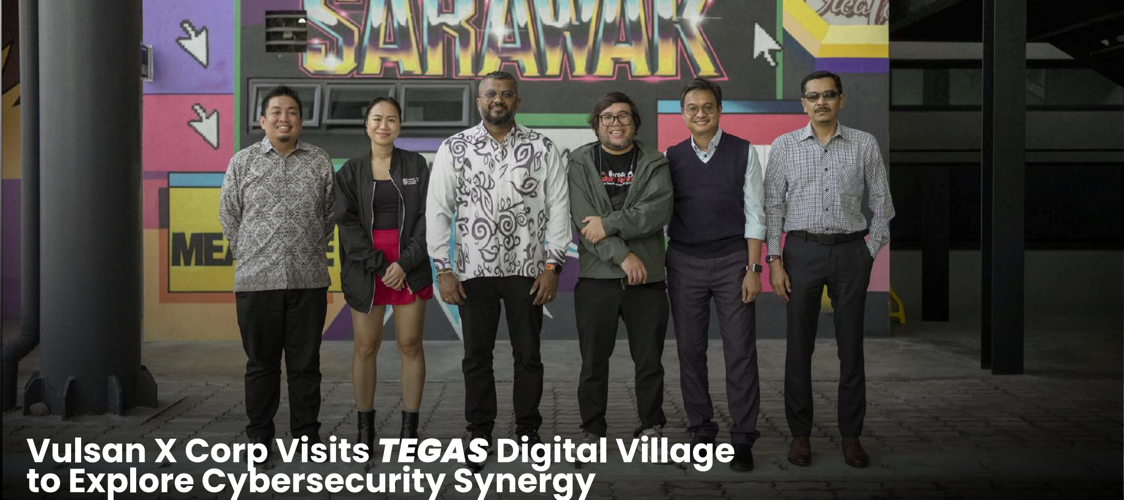
Vulsan X Corp Visits TEGAS Digital Village to Explore Cybersecurity Synergy