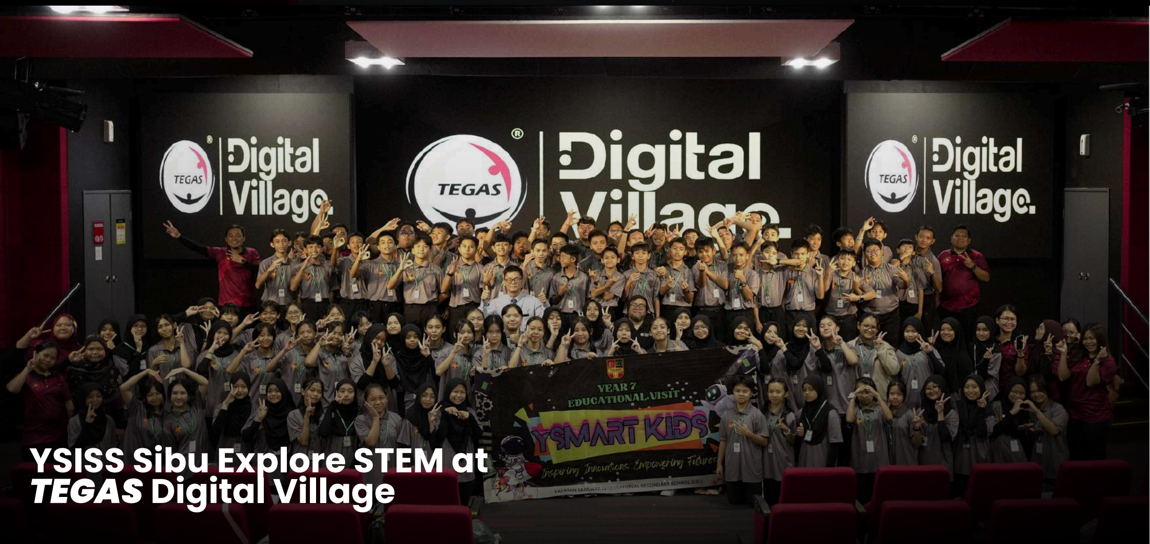
YSSS Sibu Explore STEM at TEGAS Digital Village