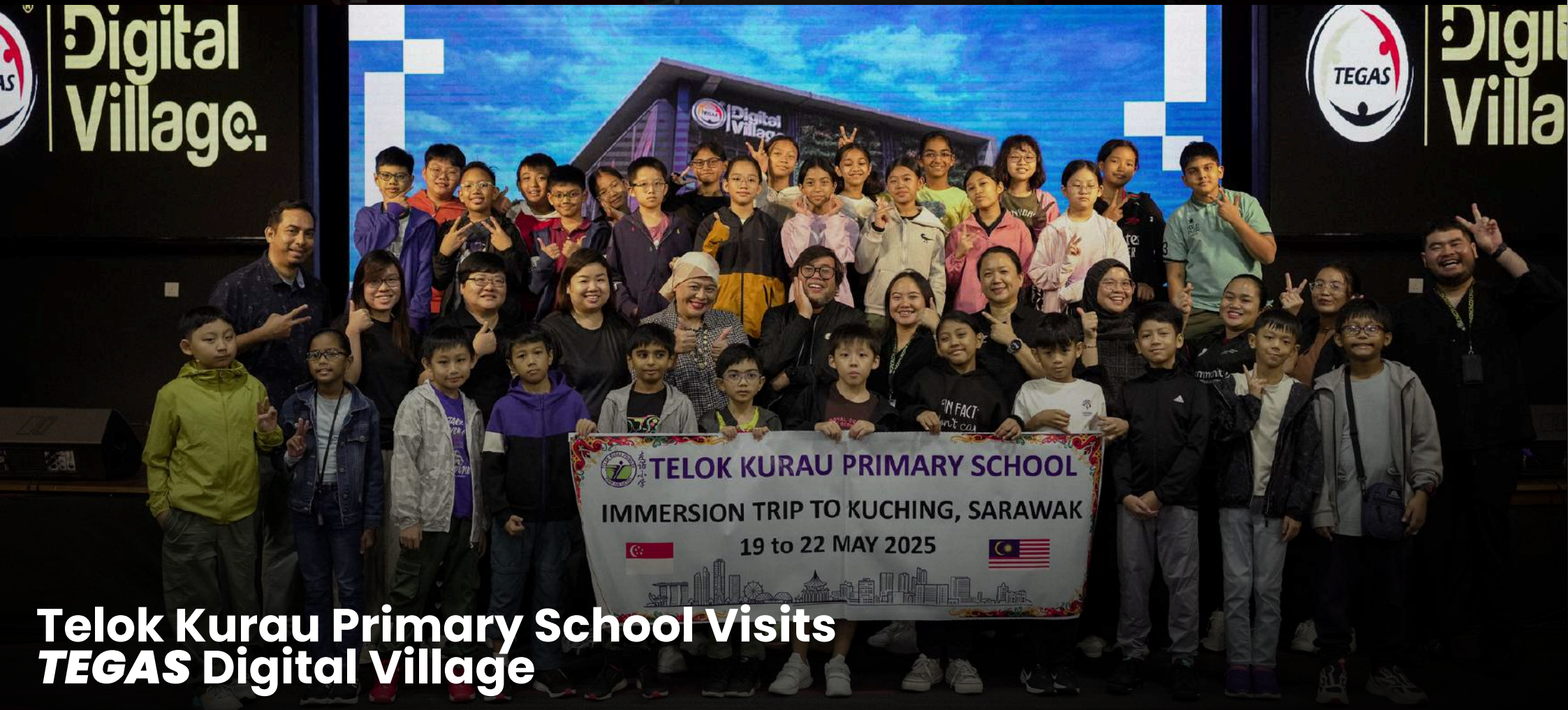
Telok Kurau Primary School Visits TEGAS Digital Village